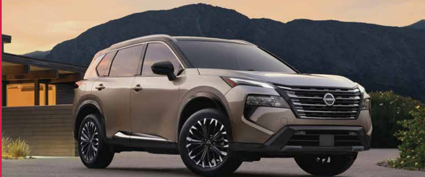
2026 Nissan Rogue