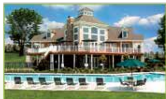
Heritage Orchard Hill - Clubhouse 1 Applewood Drive, Perkasie, PA 18944