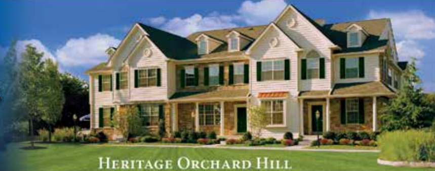
HERITAGE ORCHARD HILL