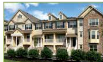
Heritage Pointe Village Way, Chalfont, PA 18914