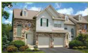
Heritage Summer Hill 4000 Lily Drive, Doylestown, PA 18902