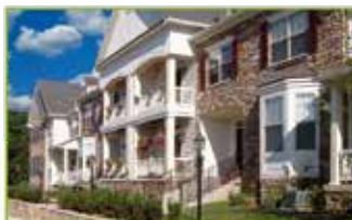
Heritage Greene 807 Ridgeview Court, Sellersville, PA 18960